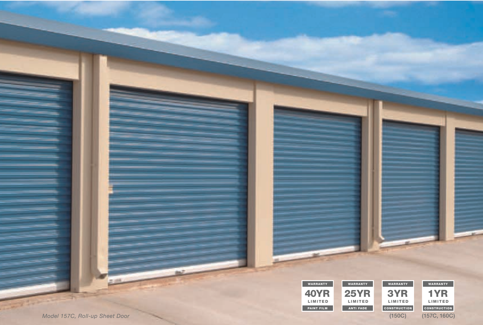
Model 157C, Roll-up Sheet Door