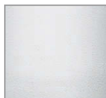
Flush Panel Design